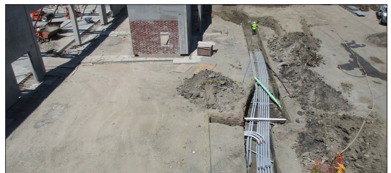
Gymnasium Building Underground Conduit