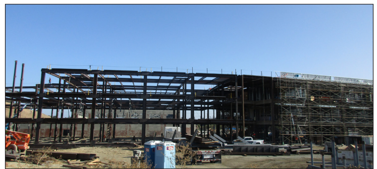
Classroom Building Steel and Scaffold

This site is getting prepared for winter rains and all appropriate SWPPP measures are in place.