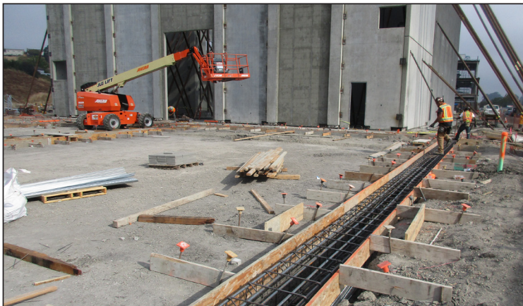
Performing Arts Building Footings