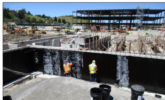
Performing Arts Building Waterproofing