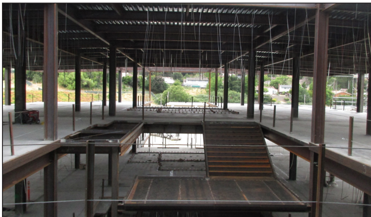
Classroom Building Deck and Stairs