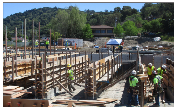
Performing Arts Building Wall Forming

The SWPPP specialist is on site weekly for monitoring