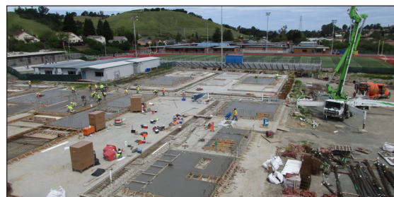
Gymnasium Panel Pour

The SWPPP specialist is on site weekly for monitoring.