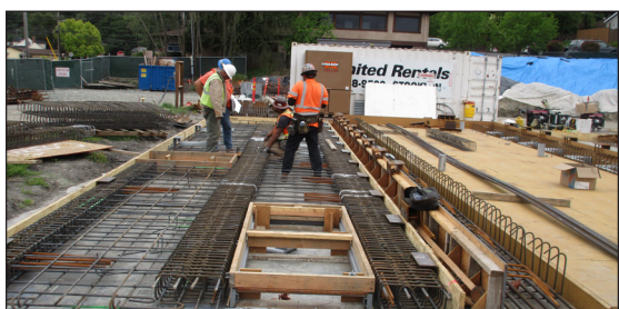
Performing Arts Building Panel Forms