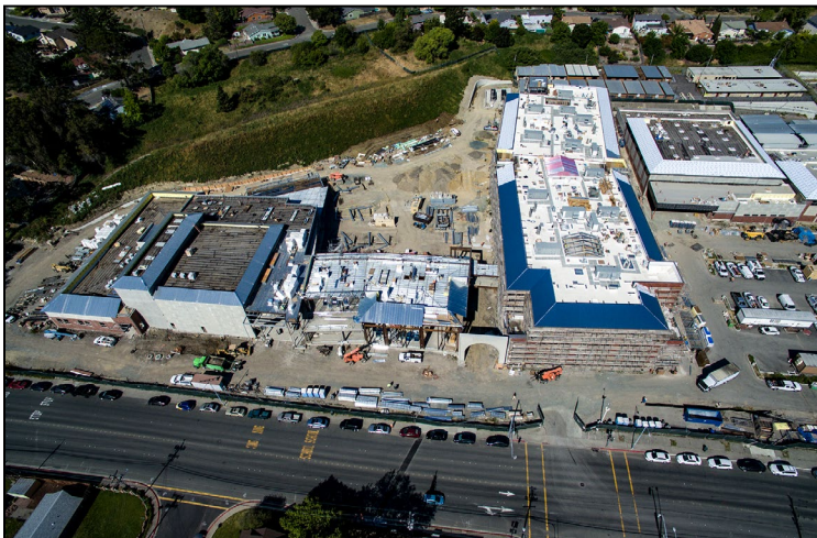
PVHS New Campus Bird's Eye View