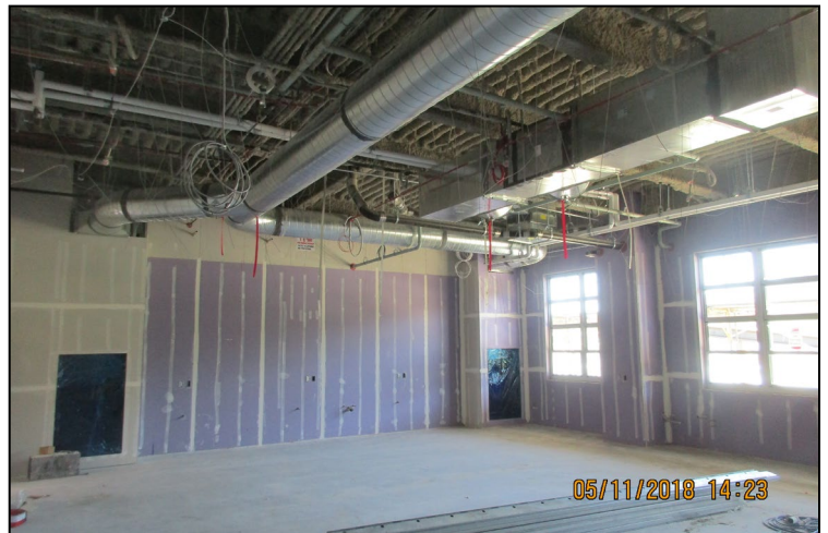
Classroom with Windows, Gypsum Board Walls, and Overhead Electrical, plumbing, and Ductwork.