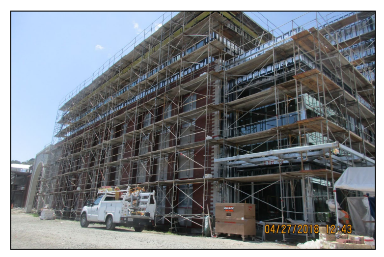
Classroom Building Brick Veneer and Storefront Windows Installed