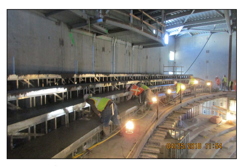
Concrete Pour of Framed Seating Decks on Theater Balcony